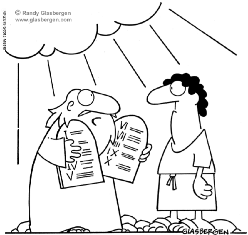
"I downloaded them from a cloud."

A minister told his congregation, "Next week I plan to preach about the sin of lying. To help you understand my sermon, I want you all to read Mark 17."